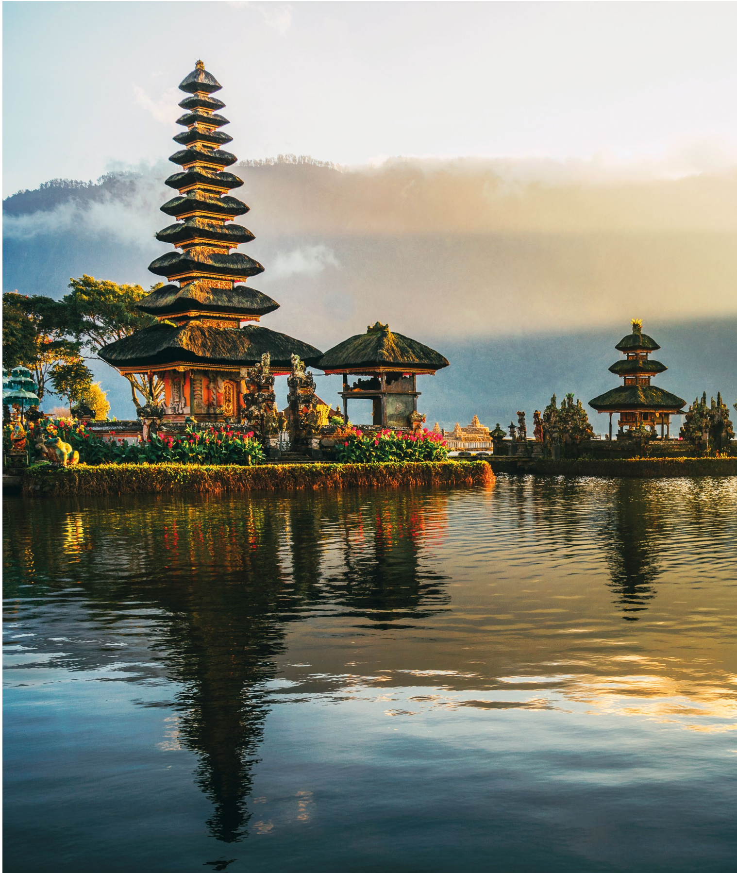
Ulun Danu Beratan Temple at sunset, Bratan, Bali, Indonesia