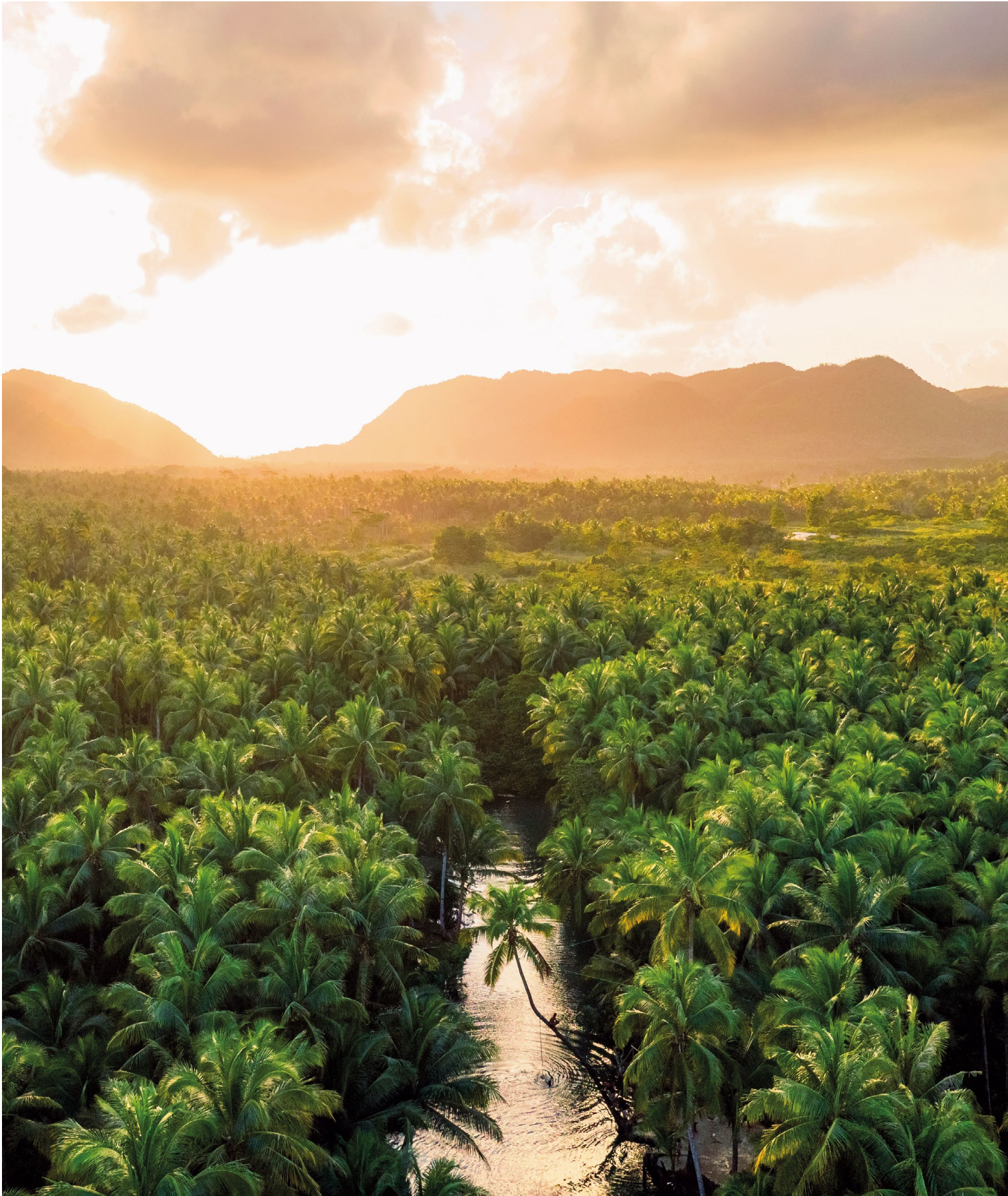
The Amazon rainforest at sunset, Brazil