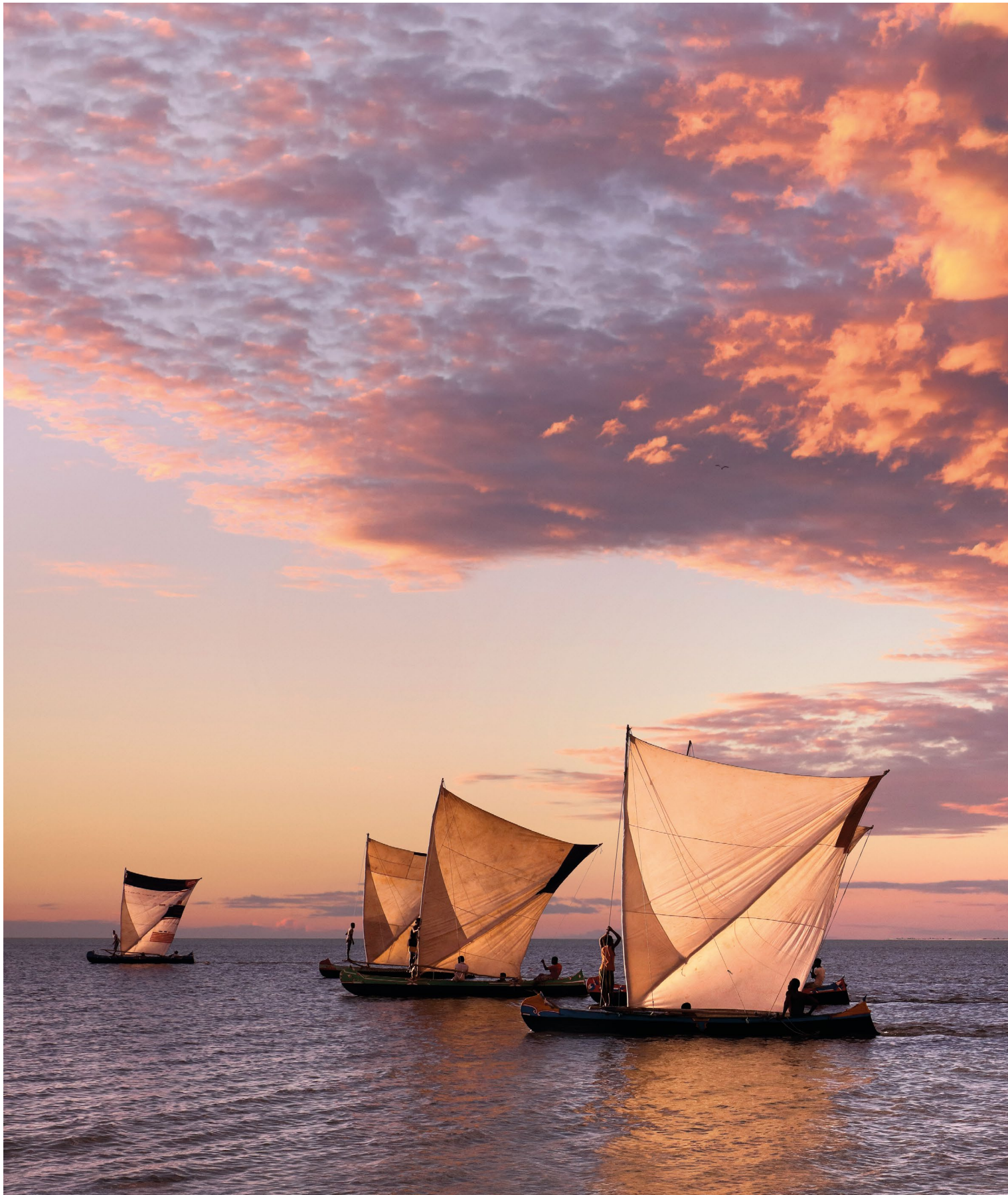
Traditional fishing pirogues in Anakao, Madagascar