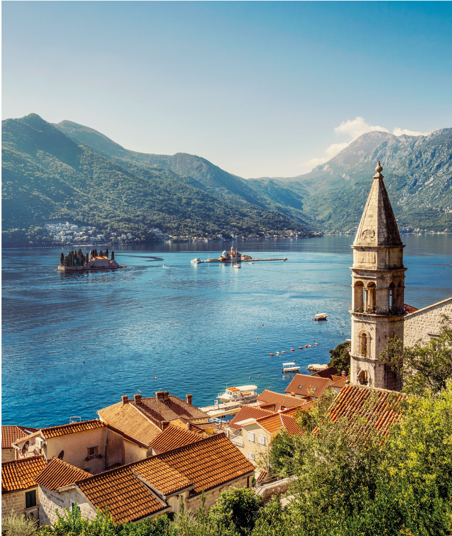
The village of Perast, in the Bay of Kotor in Montenegro.