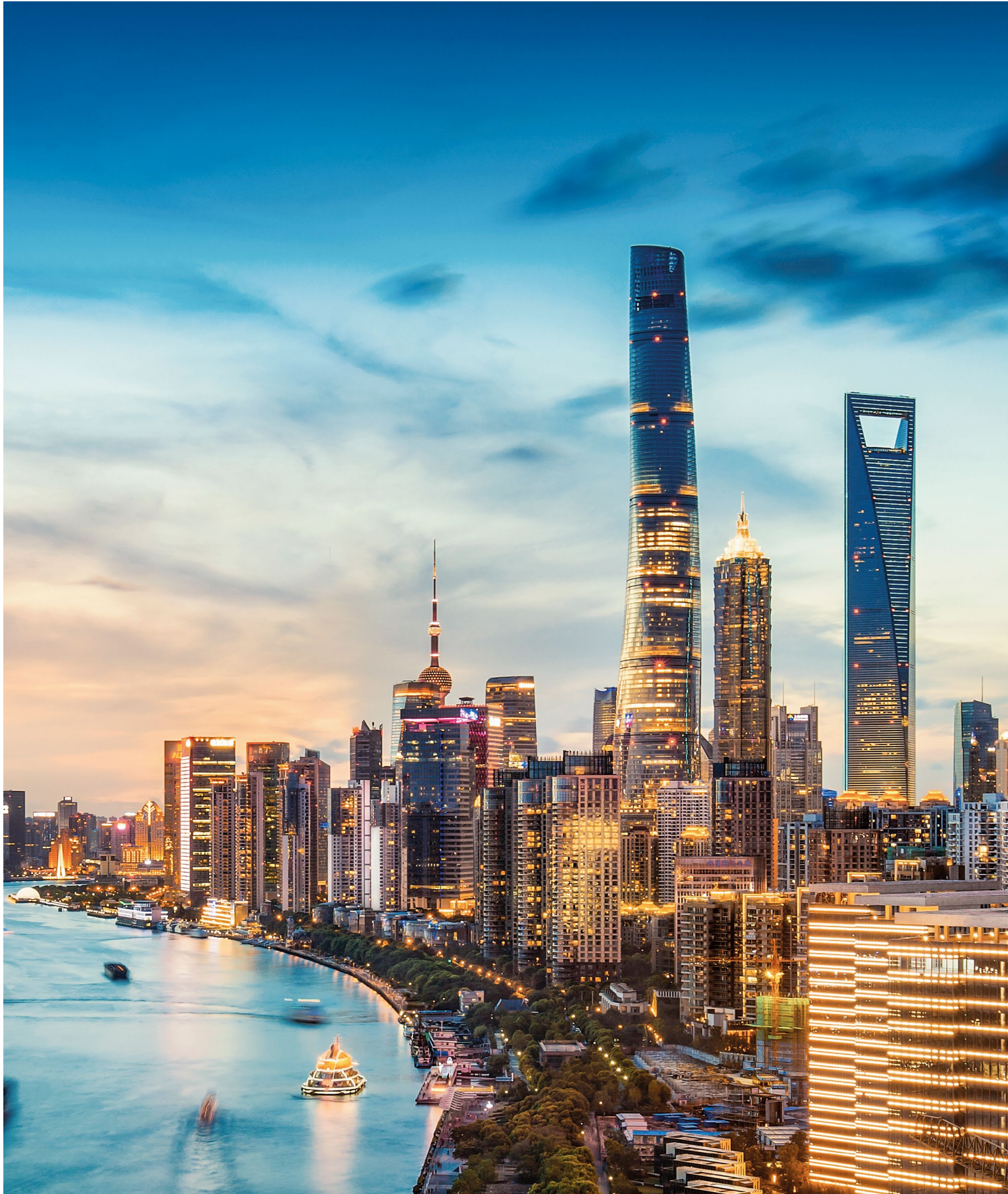
Night-time in Shanghai