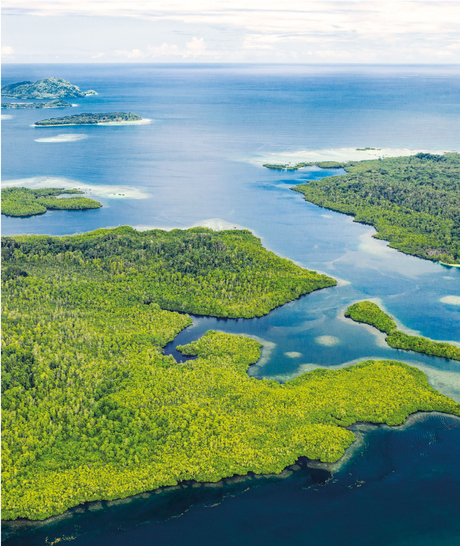
Near Gora Gosele Passage, South Choiseul, Solomon Islands