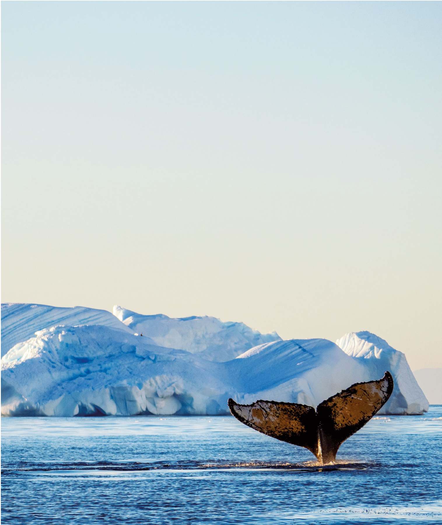
A humpback whale bubble-net feeds at sunset