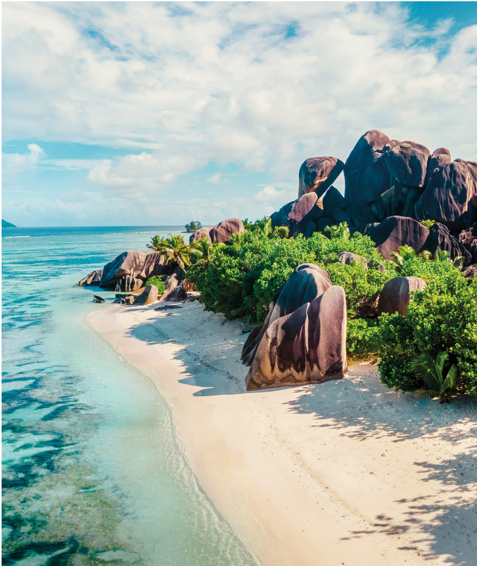
Anse Source d'Argent beach, La Digue, Seychelles